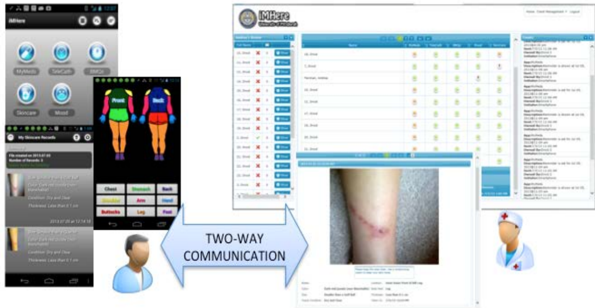
Architecture of the iMHere System